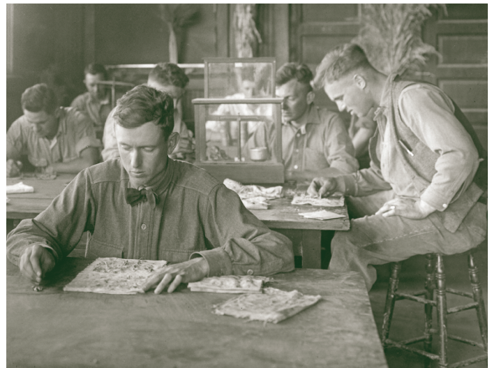
For 100 years, UC Davis has prepared and inspired students and developed solutions to some of society's most pressing problems. As we look to the future, we will continue to address issues that matter most to California and the world.

In fact, UC Davis has been training teachers (beginning with agriculture education specialists) for more than 90 years. We are proud to build on this tradition and extend the campus's reach into the lives of schools, teachers and students throughout our state and beyond.